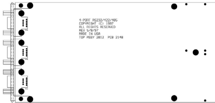
COMPONENT PLACEMENT VIEW - SIDE #1

broken out to four individual 9-pin Standard D-Subminiature connectors for rear-I/O connection.